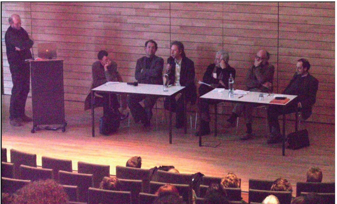
DOSSIN KAZERNE MECHELEN - FINAL PLENARY SESSION - 18 maart 2007

"Dossin-Mechelen: Thinking the future of symbolic places" , brought together around 140 master students in Architecture from over 20 European universities, around 40 tutors and visiting professors, and a series of lecturers on March 13-18, 2007.